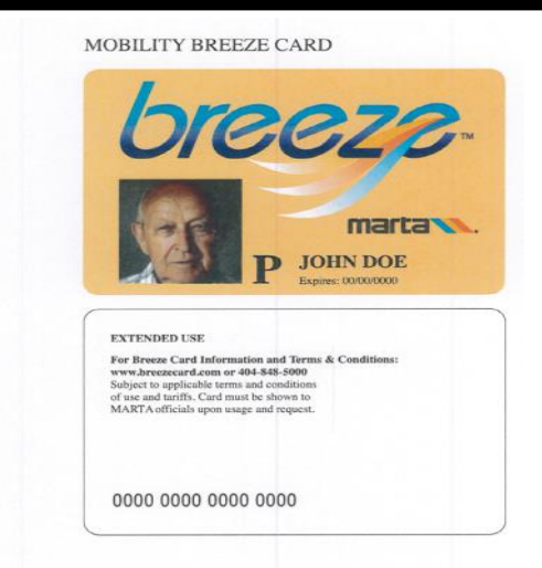
MARTA Mobility Breeze Card